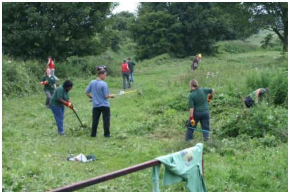
Environment Agency, Fradley staff work party at Fosseyway.