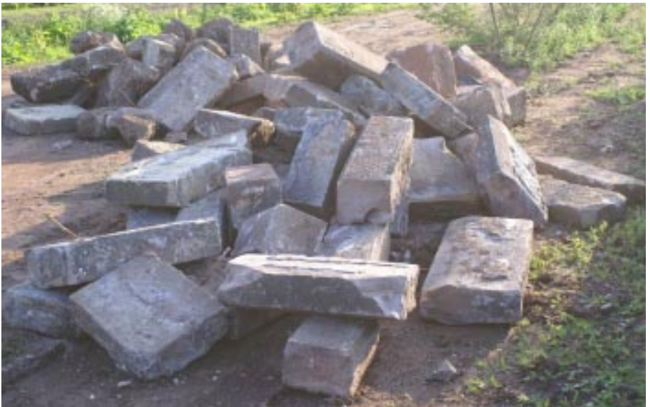
Demolished sandstone bridge parts donated by Birse Rail.