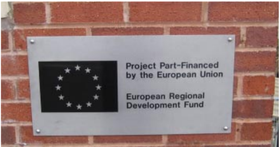
Cappers Bridge Plaque.