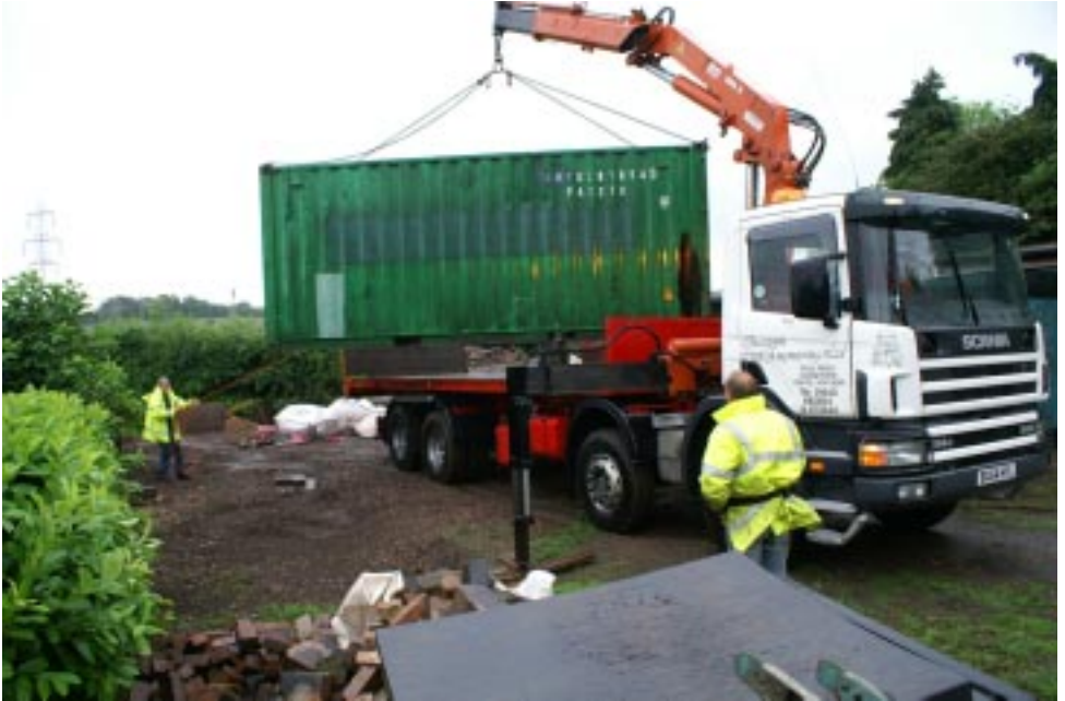
Container relocation by Chasetown Civil Engineering Ltd.