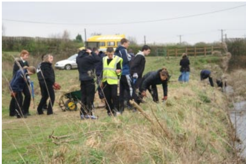
Great Barr School at work at Darnford