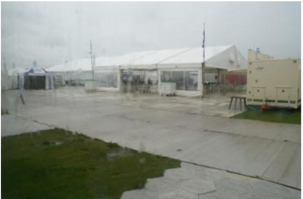
Crick Show rain-swept site on mid morning, (Bank Holiday) Monday

HUDDLESFORD BOAT GATHERING Saturday 22 nd September 2007