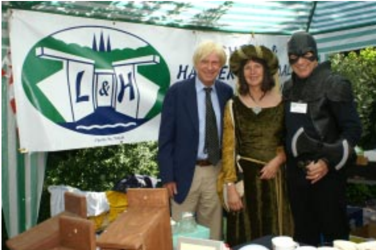
Michael Fabricant MP at the Lichfield Medieval market