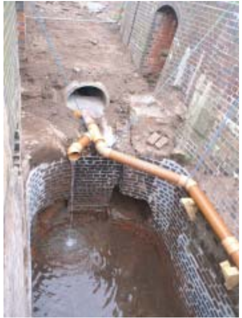
Lock 25 head repaired