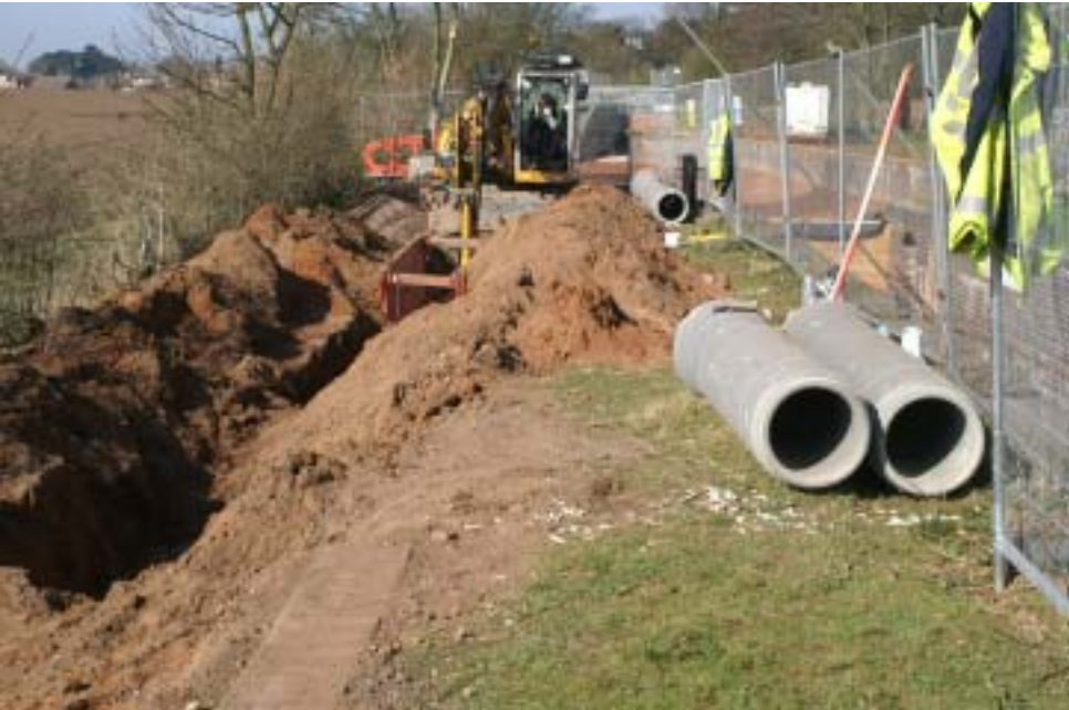
Tributary pipeline diversion round Lock 26