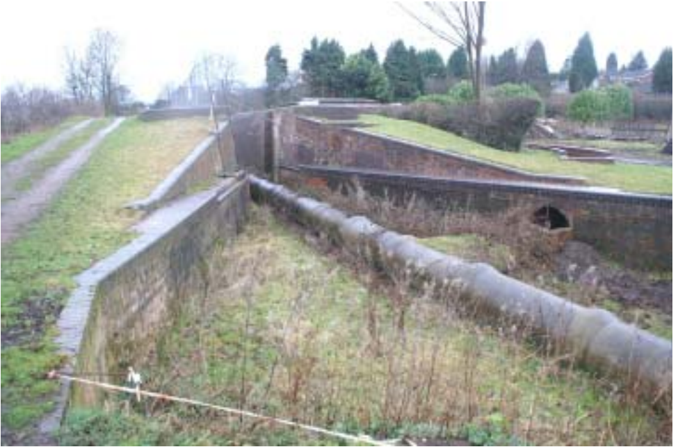
Lock 26 tail before work started