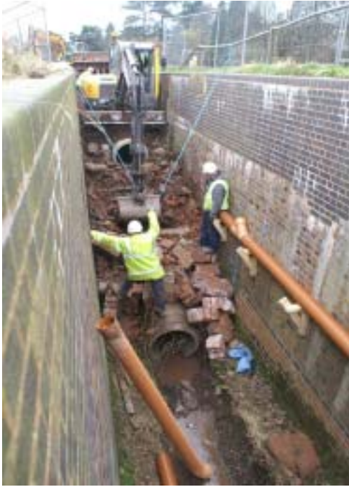
Lock 25 shaft demolition

In Civil Engineering terms the re-watering of Pound 26 does not rank among the most ambitious of projects, but in the words of the men from McPhilips “it was very enjoyable”.