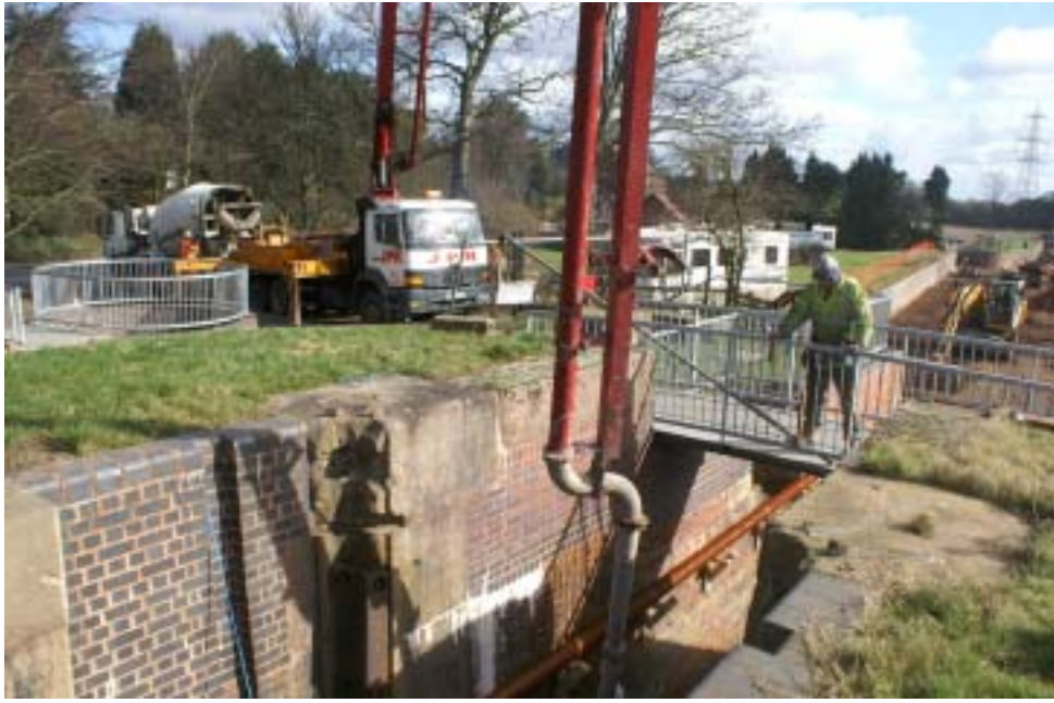
Pumping concrete into Lock 25