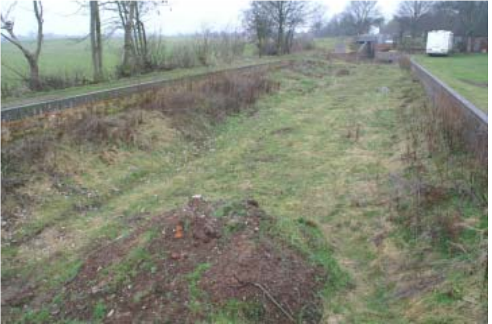
Pound 26 before work started