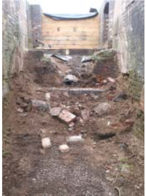
Work to do in Lock 26