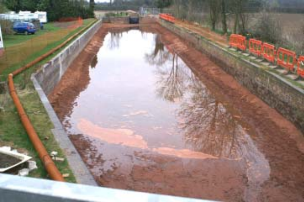
Letting in the first water