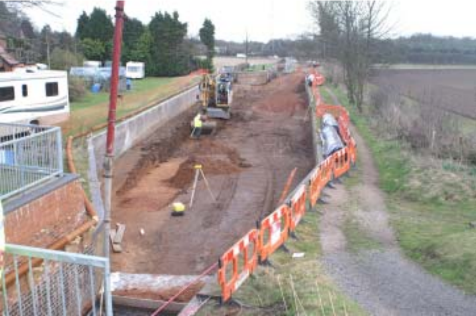
McPhillips levelling Pound 26 base