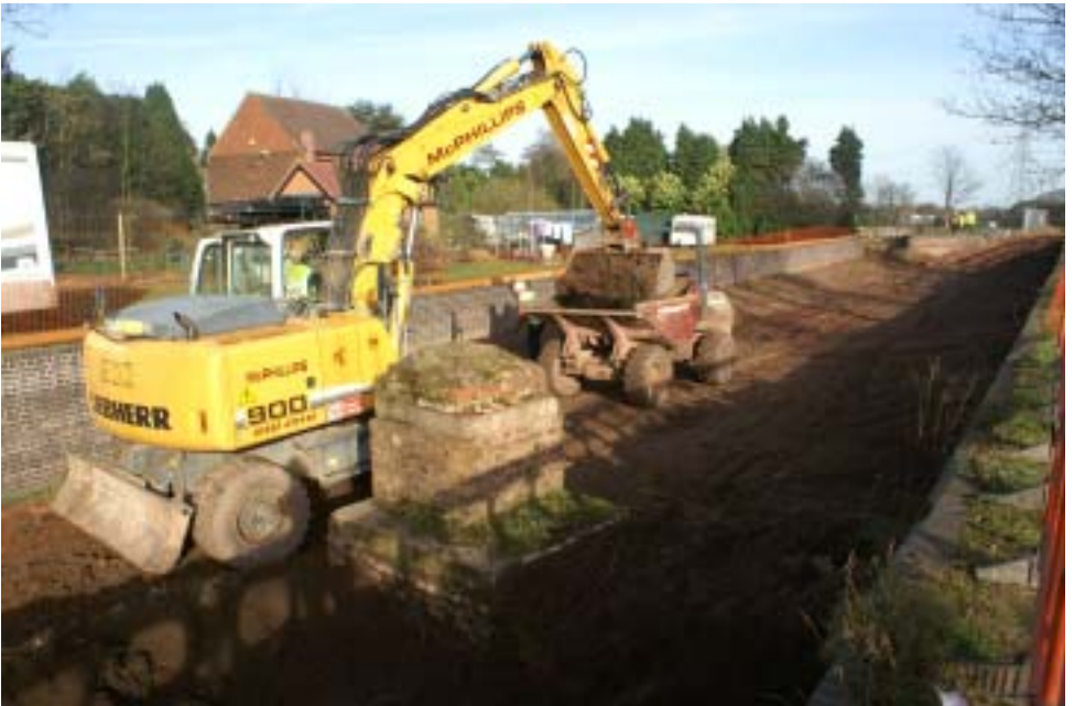
McPhillips clear Pound 26