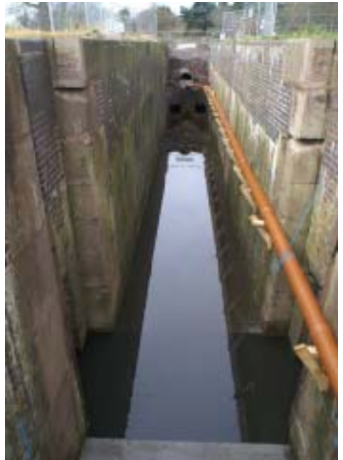
Lock 25 after work finished