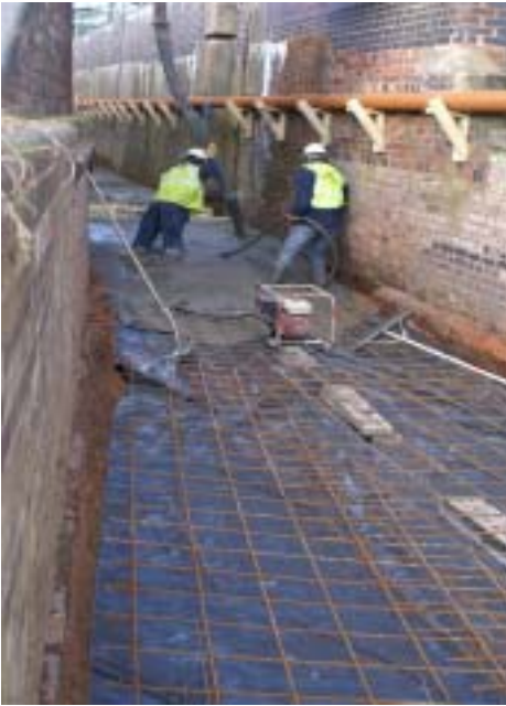
Laying concrete in Lock 25