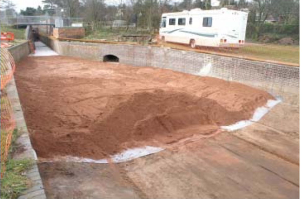
Covering the bentonite waterproof matting