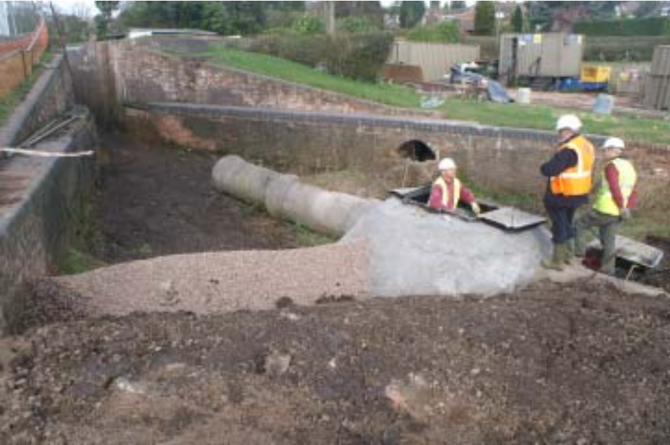
Lock 26 tail after work finished