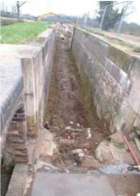
Lock 26 cleared