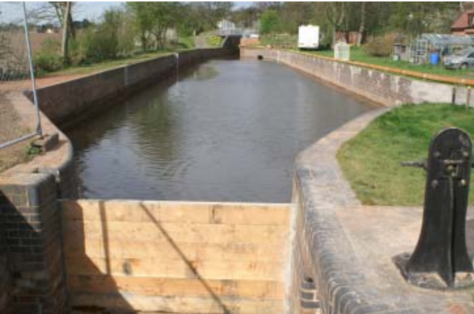
Pound 26 looking like a canal