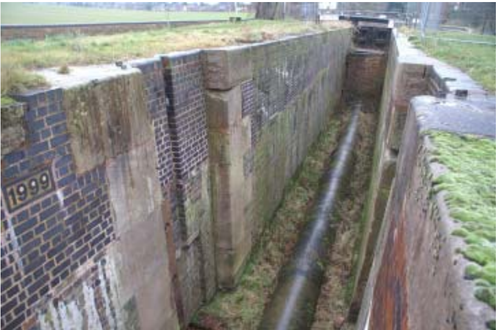
Lock 25 before work started