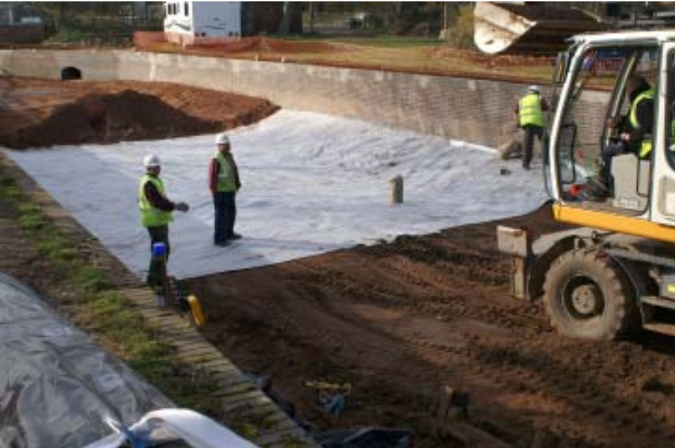
McPhillips laying bentonite waterproofing